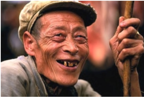
Kept out until McCarran-Walter, 1952.

country was unintended and unexpected. Political/cultural elites simply thought the old quotas were “racist,” and had to go. Legislators were more concerned with demonstrating fashionable progressive values than in tracing out the logi-