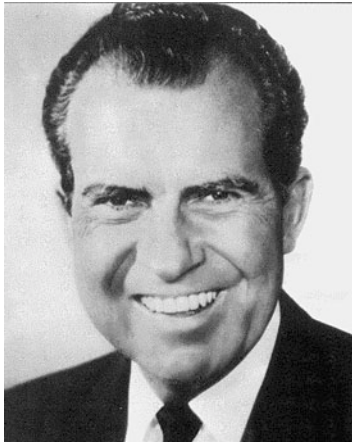
Richard Nixon: gave us racial preferences.

The Office of Federal Contract Compliance at the Labor Department formulated what became known as “the Philadelphia Plan.” Federal contractors in Philadelphia had to take immediate steps to ensure that their work forces mirrored the proportion of minorities in the Phila-