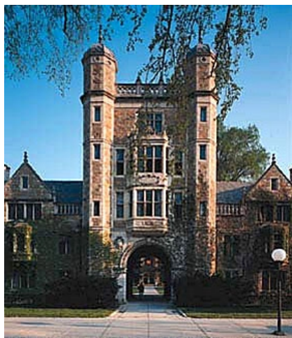
University of Michigan Law School.

account how much diversity any one individual might contribute. For instance, they noted that the school gave preference to a black graduate of Choate and Harvard over a poor, rural white applicant, and questioned whether the black really contributed more to campus diversity. Michigan appeared to be