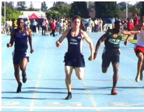
The finish of the 100 meters.

County. He had won his heats the day before, and had recorded the day’s fastest time in the 100 at 10.40 and the second fastest in the 200 at 21.02. He was assigned lane five, the premier position, for the 100 meter final. As the runners