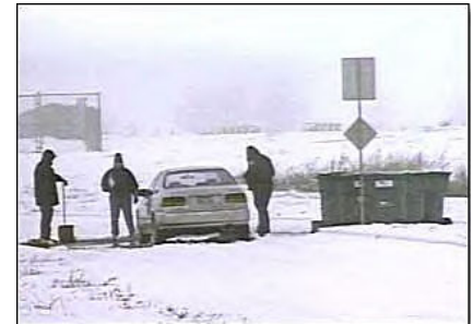
Where the bodies were found.