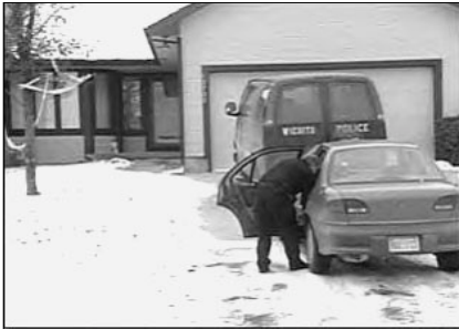
Where the three men lived.

prison for theft. He was also ordered to serve six months each for aggravated assault and subverting the legal process. In 1996, he was sentenced to 28 months on a drug charge. He was paroled on March 28, 2000, but that November was booked for drunk driving. A few days later he was back before a judge, charged with forgery and parole violation. Police mistakenly let him out six months early on Dec. 5, 2000, just two days be-