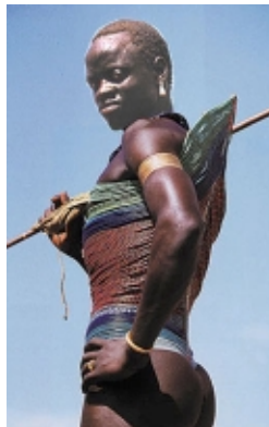
Dinka in Sudan.