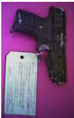
The murder weapon.