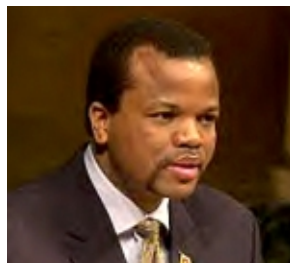
His royal highness needs more wives.

The Swazi High Court tried to interview the woman several times after taking the case in October, but the royal