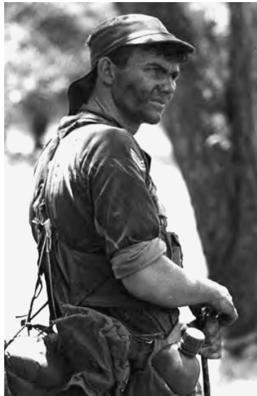
Rhodesian Selous Scout. Was he fighting for his race and civilization or was he fighting communism?

Jefferson, and a whole universe of assumptions about human nature, human society, science, religion, ethics, and cultural values—assumptions that can no longer be taken for granted. So secure was this cultural consensus among almost all whites that racial consciousness really did not need to appeal to race itself very much or very directly. Today, that shared cultural (and political) fab-