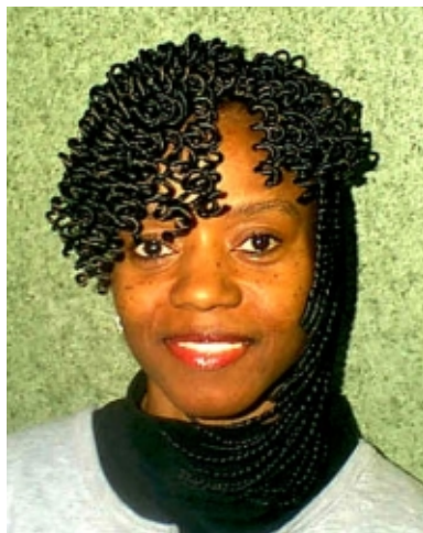
Wash once a week.

"Our hair . . . contains many microscopic (tiny) knots. These knots make