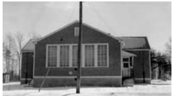
. . . more money would not make much difference.

Still, every court order so far had been directed to schools in the once-segregated South. The rest of the country could look on in smug superiority as Southern whites battled busing, set up private schools, fled to the suburbs and, in some cases, even closed down public schools rather than submit to “racial balancing.” At least in the South, whites clearly did not like forced race-mixing, and would go to great lengths to avoid it. To the elites of the time, this was precisely the kind of prejudice busing was