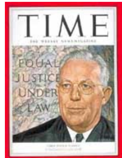
Earl Warren: another hero to the liberals.