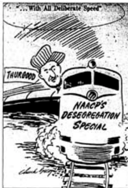
From the Baltimore Afro-American , July 2, 1955.

should never preempt law-making by elected representatives; republican government has been badly eroded by the process set in motion by Brown .