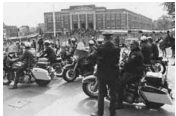
What it took to do it.

Busing in Boston was perhaps more traumatic and disruptive than anywhere else. In 1967, the public schools were 73 percent white. The average black student, however, attended a school that was only 32 percent white, which means schools were substantially segregated. This reflected the fact that most blacks were clustered in Roxbury, in the southern part of town. Court-ordered busing came in 1974, but the mere rumor of it was enough to send whites to the suburbs. By 1973, white enrollment had