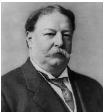
Chief Justice William Howard Taft . . .

Before 20th century theories about racial equivalence, people took it for granted that racial differences justified different treatment. As the Georgia Su-