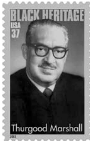
He is now a hero.

Marshall started and ended was weak. He leaned heavily on the work of Kenneth Clark, a black researcher known for doll studies. Clark reported that if he showed a pair of black and white dolls to black children attending segregated schools and asked them which doll they liked better, a substantial number picked the white doll. He argued to the Court that this proves segregation breeds feelings of inferiority. He failed to mention that he had shown his dolls to hundreds