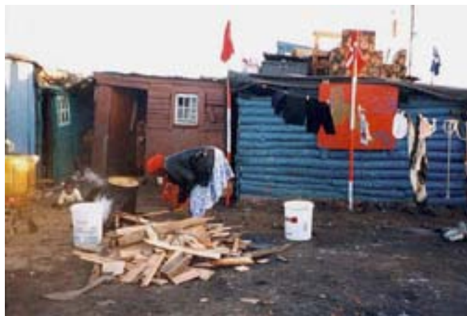
A slum in South Africa.

Two sociologists from the National Council of Scientific Research in France recently conducted a survey of minors who were convicted between 1985 and 2000 by the courts of Grenoble, a city in the southwestern French district of Isère. They found that although immigrant families make up only 6.1 percent of Isère's population, an astonishing 66.5 percent of the convicts had a foreign-born father, and 60 percent had a foreign-born mother. The fathers of 49.8 percent of the offenders were from northern Africa. This is a nationwide problem. The Institut National des Statistiques et des Études Économiques has found that 40 percent of French prisoners had a foreign-born father; 25 percent had a father born in northern Africa. One researcher writes, "The overrepresentation of youths of foreign origin among juvenile delinquents is well known, but this fact is little reported and never debated in the public sphere." [Selon une Étude Menée en Isère, Deux Tiers des Mineurs Délinquants sont d'Origine Étrangère, Le Monde (Paris), April 15, 2004.]