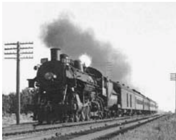
. . . would never have overturned Plessy v. Ferguson .

The case of Beauharnais v. Illinois , rendered just two years before Brown , underlines the hypocrisy of consulting social science rather than the Constitution. In this case, the Court specifically refused to do precisely what it insisted