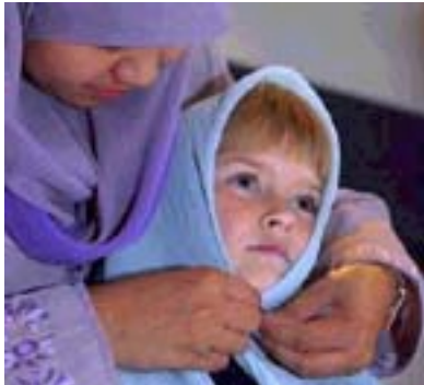
The fate of the West?

in Thann for wearing the scarf. School authorities allowed her to attend another area school on the condition that she wear a much smaller bandanna rather than the head-and-shoulders hijab , but after a few days, she showed up in full regalia. Teachers went on a day-long strike to protest her disobedience, and