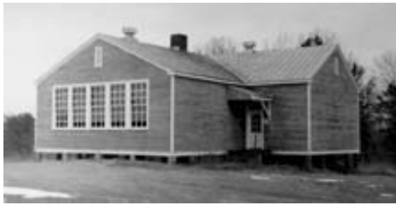
Segregated black schools in Virginia in the early 1960s . . .

ruling sink in, before issuing another ruling on how to do what the Court ordered. It is here that we find the famous linguistic fudge: desegregation was to be accomplished with “all deliberate speed.” The South was going to have to abide by the Constitution, but it could drag its feet. “It was entirely unprincipled,” Elman wrote in 1987; “it was just plain wrong as a matter of constitutional law, to suggest that someone whose personal constitutional rights