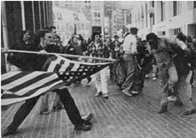
Protest against busing in Boston.

“racial balance.” This, however, was the effect of the new Court rulings. It was as if blacks and whites had to check with a central authority whenever they wanted to see a movie, and were directed only