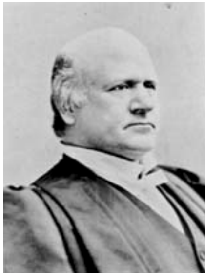
Justice John M. Harlan

visions as beyond the scope of Congressional power under the 14th Amendment . In what became known as the “Civil Rights Cases,” the Court asserted that the rights protected by the Amendment were exactly those defined—to own and convey property, enforce con-