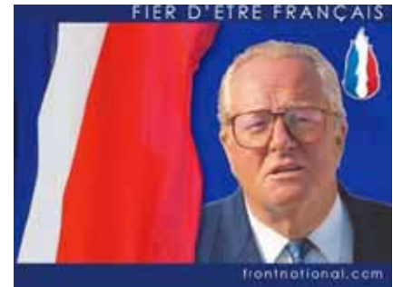
Jean-Marie Le Pen is an admirer.

Although I greatly admire Miss Bardot’s political courage and French patriotism, what most strongly impressed me about this book was her concern for animals. I will never look at a