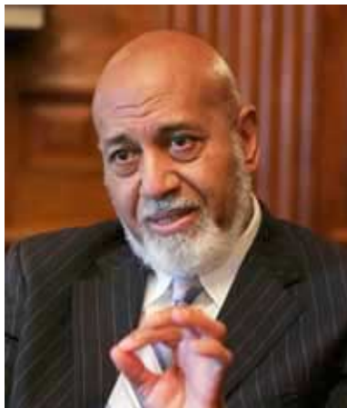
No plum for Alcee Hastings.

What can we expect to see as the CBC begins to push its agenda? Hearings on hate crime laws, reparations, and conspiracy theories about Katrina relief and voter disfranchisement. The CBC will