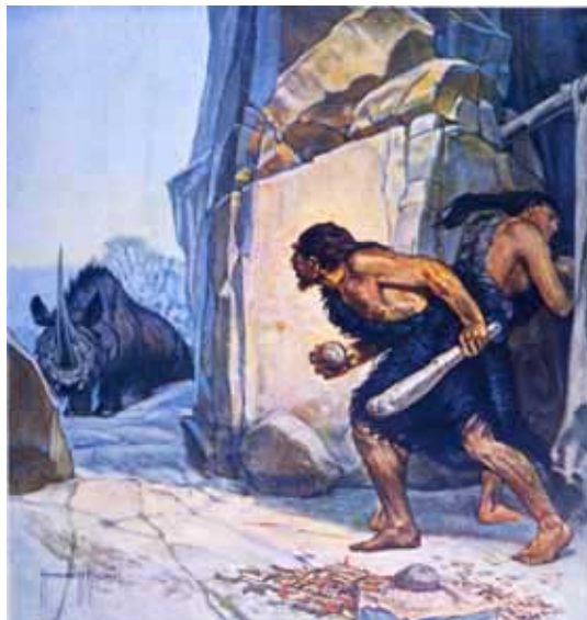
Your ancestor or mine?

waves between 25,000 and 40,000 years ago, or Neolithic farmers who arrived from the near East after the invention of agriculture 10,000 years ago. A new