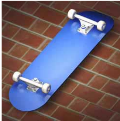
Toyz in the hood.

began taunting them with lewd remarks and obscene gestures. The women ignored them, but the harassment continued. The situation escalated when the