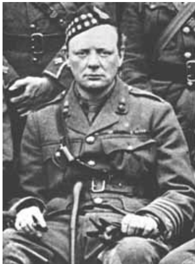
Churchill as a young man.

and cruel breed, more shocking because they are more intelligent than primitive savages. The stronger race soon began to prey upon the simple [black] aboriginals. . . . To the great slave-market at Jeddah a continual stream of Negro captives has flowed for hundreds of years. The invention of gunpowder and the adoption by the Arabs of firearms facilitated the traffic by placing the ig-