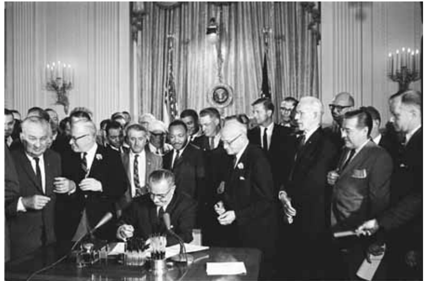
Lyndon Johnson signs the Civil Rights Act of 1964.

three points; being the child of an alumnus, four points; personal achievement, leadership, or public service, a maximum of five points; a perfect score on the SAT or ACT, 12 points; and being black, Hispanic, or Native American 20 points. The only other qualification worth 20 points was the difference between a 4.0 (i.e., straight As) high school GPA (grade point average) and a 3.0 (a B average). Socioeconomic background made no