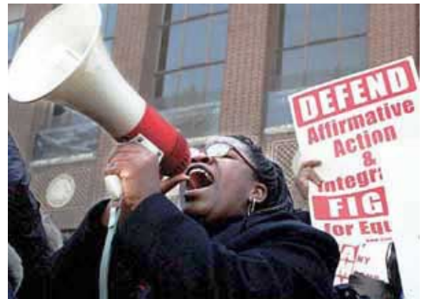
By Any Means Necessary at the hustings.

At U-M medical school, in 2005, the odds favoring a black or Hispanic applicant over a comparable white appli-