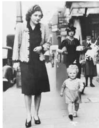
Grandson Winston also understood what was at stake.

ister John Major piled on in the ensuing criticism, but Mr. Churchill was unrepentant, claiming that despite wide-