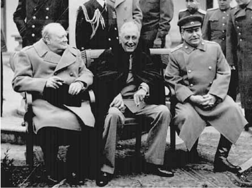
At Yalta with Roosevelt and Stalin.

which we have been cast by a powerful section of our own intellectuals. They come from the acceptance of defeatist doctrines by a large portion of our politicians. But what have they to offer but a vague internationalism, a squalid materialism, and the promise of impossible utopias?"