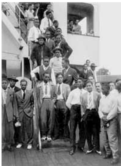
Faces from the Empire Windrush , which arrived in 1948 with the first load of Commonwealth immigrants.

ably had the sentiments typical of the period. One of Mr. Churchill's private secretaries remembered that "at that time it seemed a very good idea to get [coloured] bus conductors and stuff." A junior minister complained that "it was becoming hard to find somebody to carry your bags at the station." As one minister put it later, "we were just stalling and hoping for the best." After Churchill resigned, the internationalist Anthony Eden took over, and any hope of serious