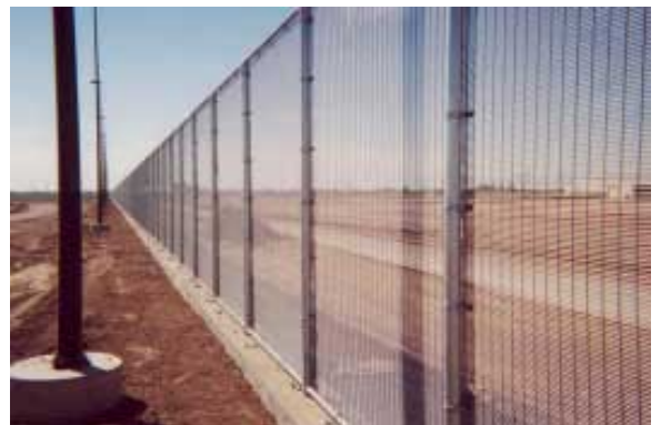
. . . keeping out illegals is 'disgraceful and shameful.'

The Mexican view of the United States is a mixture of historic resentment, envy, and contempt for a nation that submits to insult and cannot control its borders. These sentiments start at the top. Near the end of his term, former president Vicente Fox, who frequently boasted of his close friendship with President George W. Bush, explained to Mexicans why they should be thankful for their heritage. "We are already a step