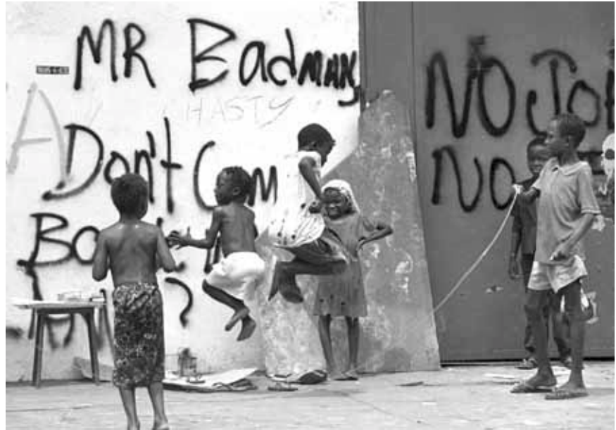
Children playing in the streets of Monrovia, Liberia.

this model of natural disasters, dispersing the community and changing the electoral process in that community.” He added that his “chocolate city” remark