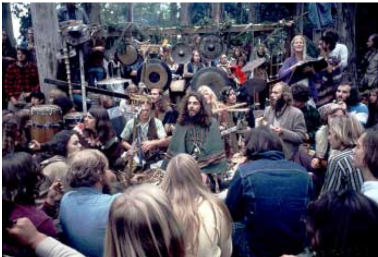
The first generation ever to win its adolescent rebellion.

out saying—is a death sentence to a race and civilization. “[B]eyond an identity that apologizes for white supremacy, absolutely no white identity is permissible,” he writes. “In fact, if there is a white racial identity today it would have