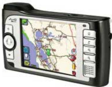
GPS will get them here safely.