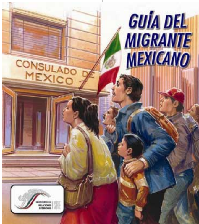
'Guide for the Mexican Migrant:' come one, come all.