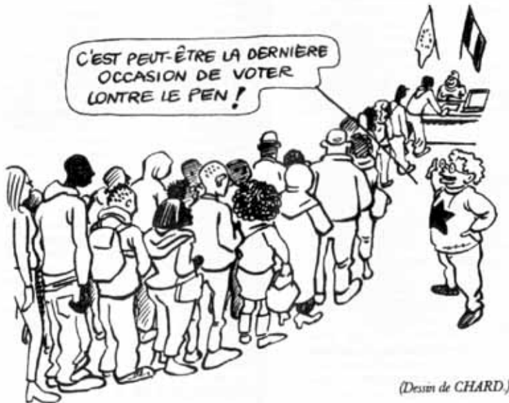
‘This may be your last chance to vote against Le Pen!’