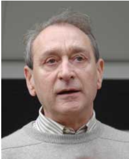
Mayor of Paris, Bertrand Delanoë.