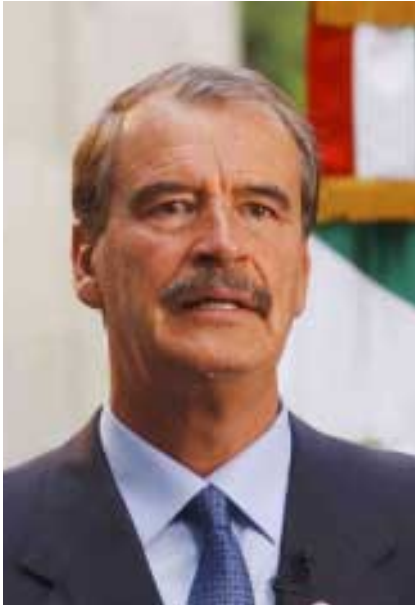
Vicente Fox says . . .

As noted above, in May 2006, Hispanics in America mounted massive demonstrations against proposed measures to control immigration. The Mexican legislature issued a declaration of support for the demonstrators, and voted