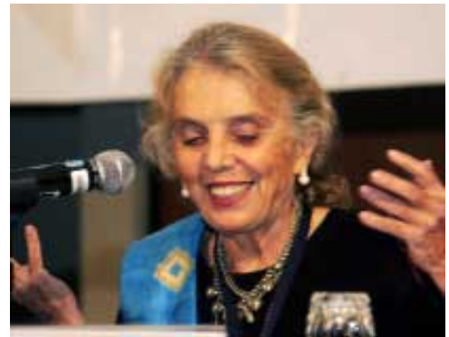
Elena Poniatowska even wants Alaska.

It is official Mexican government policy to urge Mexicans living in the United States to remain loyal to Mexico. This policy applies broadly to all naturalized and even US-born citizens of Mexican origin, but government spokesmen direct their strongest efforts towards