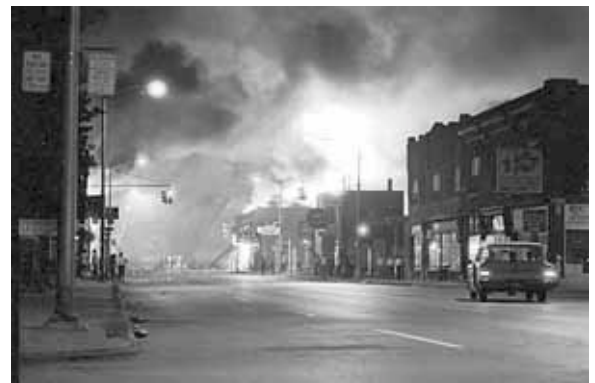
Detroit 1967: ‘burn, baby, burn.’

Even whites in positions of authority were cowed by black swagger. As Dr. Steele explains, black power grew in