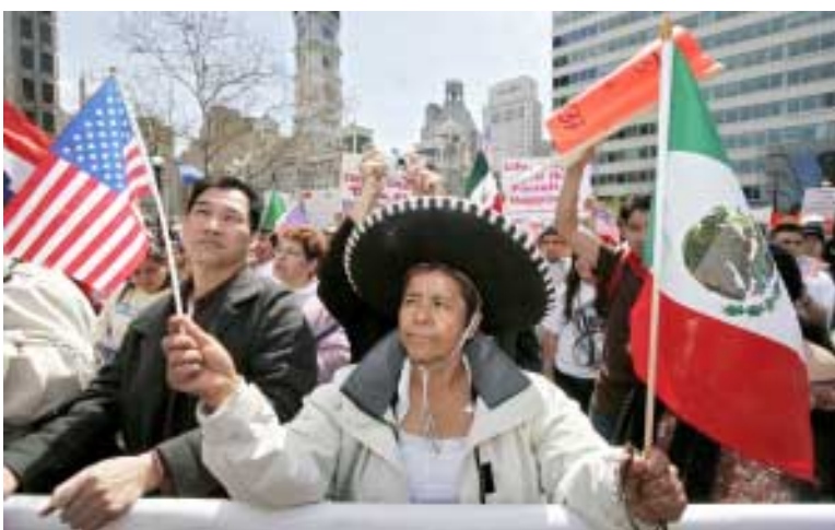
Demonstrating for amnesty. Are they Mexican or American?

Part I described the deep racial/ethnic loyalties Hispanic Americans retain to their countries of origin, and explained how they have turned their backs on assimilation and expect the United States to accommodate their loyalties and preferences. It concluded by noting that every year several thousand Mexican-Americans go home in coffins to be buried in the country they consider their true home.