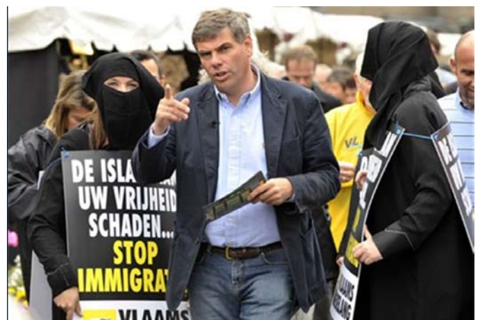
Filip Dewinter campaigns against the Muslim invasion.

This third invasion is not actual warfare. Of course, there is a terrorist threat, but the real battle is demographic. Muslims are “peacefully” overrunning Europe. Through mass immigration, conversion, propaganda, family reunification, and high birth rates Islam is marching on.