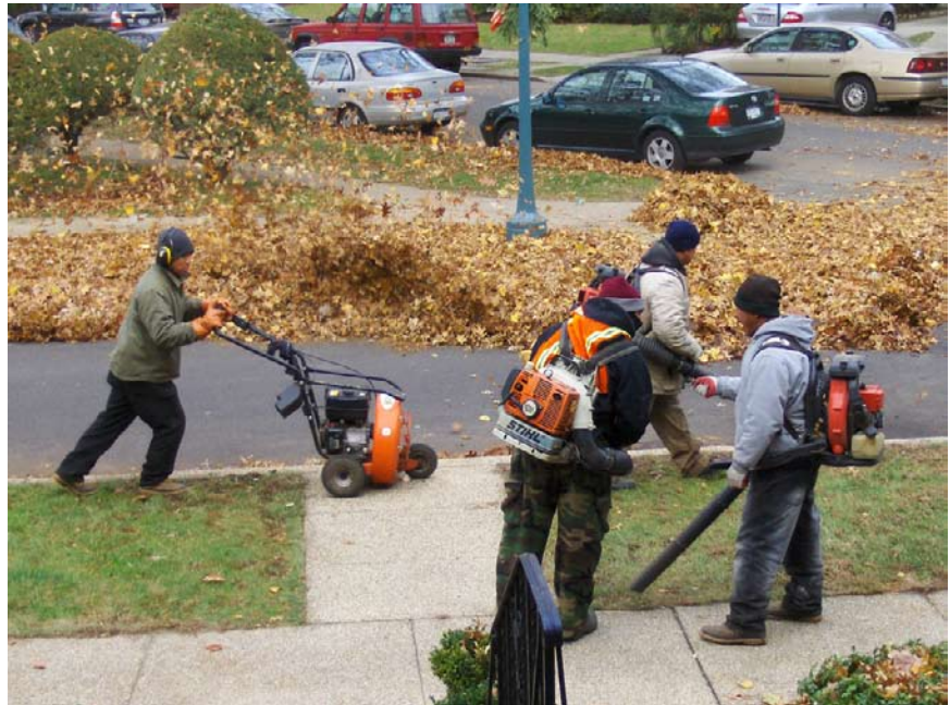
Are they illegals or are they on H-2B visas?

farm wages had to be doubled to attract Americans you would hardly notice the difference at the checkout counter. Harvesting typically accounts for only about 10 percent of the supermarket price of produce, so pickers could double their wages and an apple that