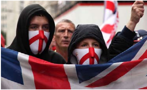
Members of the English Defense League.

British “anti-racists” are fretting over a recent poll that found 48 percent of the population would consider voting for an “anti-immigration English nationalist