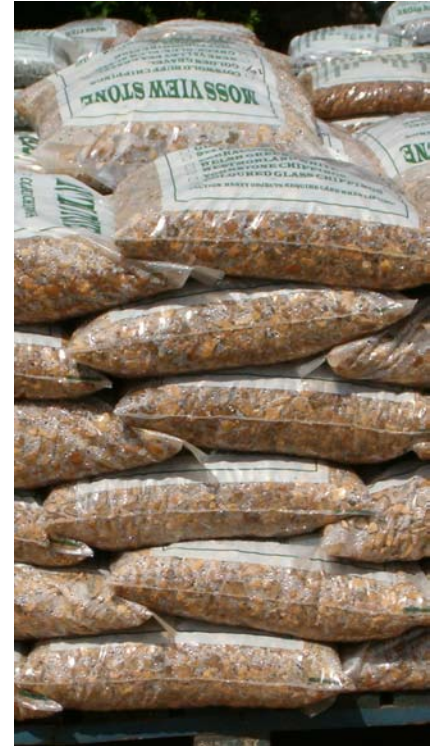
Now, lug these around.

of the recruiters did not encourage the callers to violate H-2B regulations, one Texas recruiter "suggested that we discourage American workers from accepting our landscaping job openings by having applicants run around the shop carrying a 50-pound bag to determine [whether] they were fit for the work."