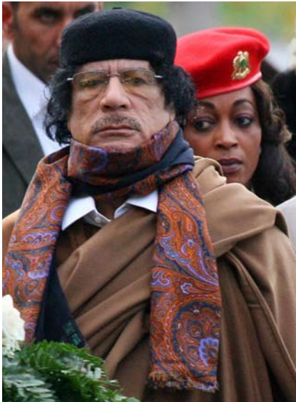
Col. Gadhafi and a female body guard. “Europe will turn Muslim.”

The Left cultivates a number of guilt complexes in order to weaken European resolve. It trumpets racism, anti-Semitism, slavery, colonialism, and xenophobia as Europe’s original sins. Because of this allegedly shameful record, the European people no longer have a right to their own identity, culture, and traditions. In the Leftist world view, European nation states are harmful anachronisms that are responsible for anything that goes wrong in this world.