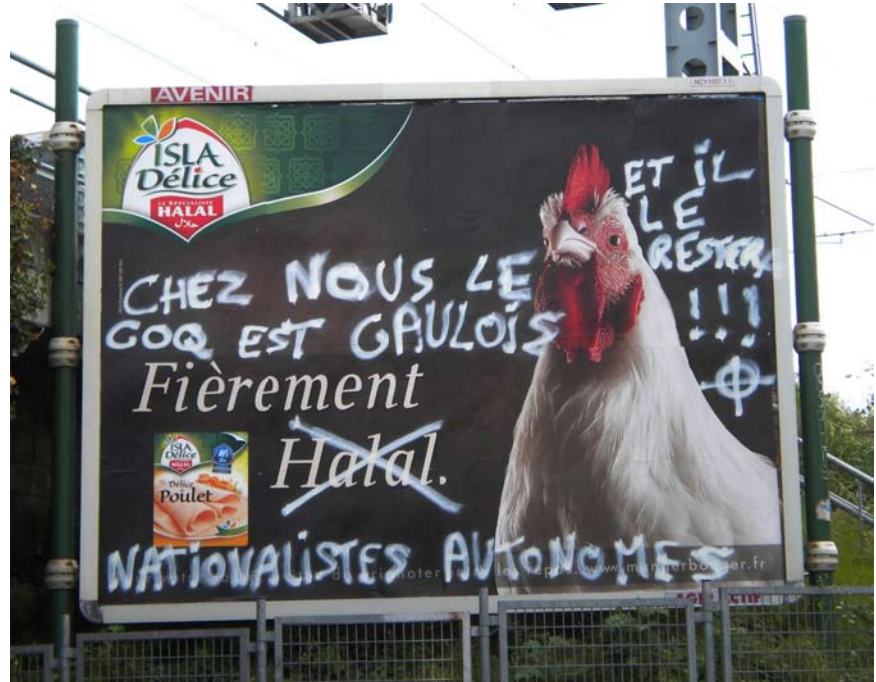
Advertisement for chicken that is "proudly halal." The graffiti says, "Our roosters are Gallic and will stay that way!!! Autonomous Nationalists."

Europe must make a choice: submit to invasion and Islamization, or resist and force Islam back. Unfortunately, the supporters of multiculturalism are still in control of the social debate in Europe.