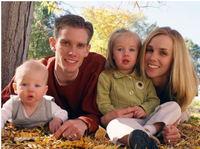
Not as many of these . . .

However, the figures for the percentages of non-Europeans in 2000 are underestimates because they are taken from census figures that do not include third-generation immigrants, who are counted as indigenous. Also, a number of immigrants do not fill in census forms—especially illegals, for obvious reasons. The projected figures for the year 2050 are also probably