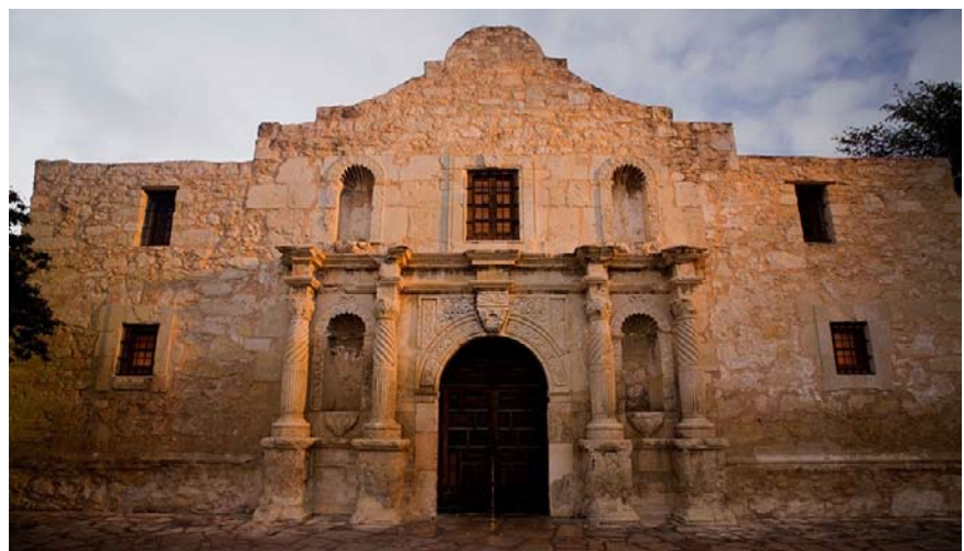
The Alamo: What was it that happened here?

Three counties, Garfield, Arapahoe, and Adams, saw their white percentages drop by more than 10 percent, and the city of Aurora became the first Colorado city with a minority majority: 53