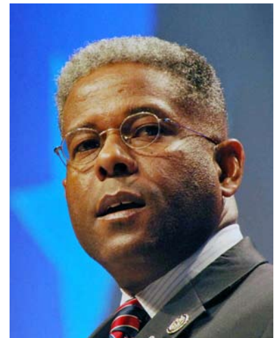
Congressman Alan West.

Whenever a non-white did appear at CPAC, his reception gave life to the old joke: “What do you call the one black person at a conservative meeting? The keynote speaker.” Indeed, black Republican congressman Alan West filled that role, giving nervous whites just the racial assurances they needed. He chided anyone who thinks conservatives are racist, adding, “Look who is the keynote speaker.” Can this undistinguished freshman congressman from Florida really think he was chosen for his stature and accomplishments?