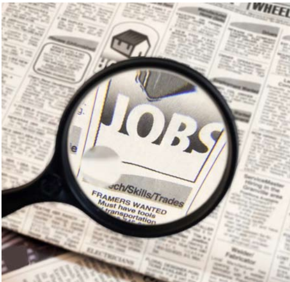
The biggest joke of all.

A prospective employer has to get a Temporary Labor Certification from the Department of Labor, which verifies that the above requirements are met. The employer then files a Petition for a Nonimmigrant Worker with USCIS on behalf of a prospective worker. The