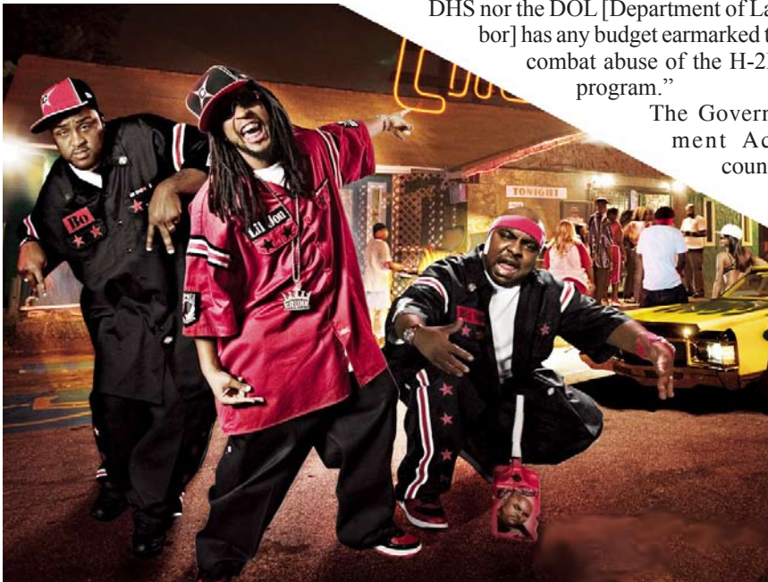
Who would you rather hire: these guys or Mexicans?

Clearly, businesses can easily come up with phony "proof" that there aren't enough Americans for the jobs, and the unemployment rates in the fields most occupied by H-2B guestworkers suggest their proofs are mostly rubbish. The Economic Policy Institute found that in 2006 and 2007, the jobless rates in the seven areas—food preparation, lodging, construction, motor freight, packing and materials handling, extraction occupations, and grounds maintenance—that account for over 60 percent of H-2B employment averaged 7.4 percent, compared to national rates of 4.4 and 4.6 percent. We can only assume that the differential is even greater, now that