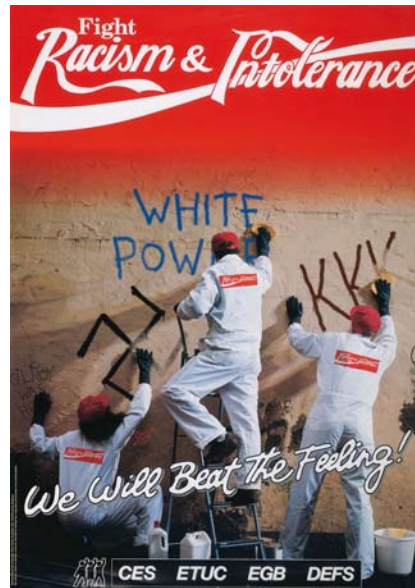
Virtue at its finest.