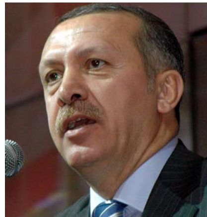
Erdogan: Only as much democracy as suits us.

In the 1980s and '90s, we were pleased to witness the fall of communism. After the Soviet Union collapsed and its terrible crimes were revealed, communism lost its credibility. The New Left then used the immigration problem to dress communism up as