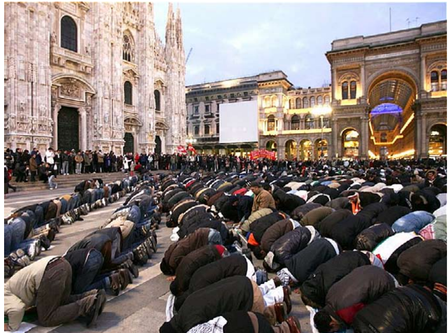
Public prayer in Milan in the square before the famous cathedral.

live in Europe, mostly in Germany, France, the Netherlands, and Austria. Some five million North Africans live in Europe, primarily in France, Spain,