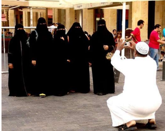
... and more family photos like these.

The complacency of the European citizens in the United States and Western Europe about the mass immigration of alien peoples, and the future prospect of becoming minorities in their own countries is unique in human history. How this mindset has come about is difficult to understand. It is contrary to what Robert Ardrey described in his book, The Territorial Imperative , as the human instinct to defend national territory against invaders, yet somehow during the last half century the European peoples have lost this instinct. Q