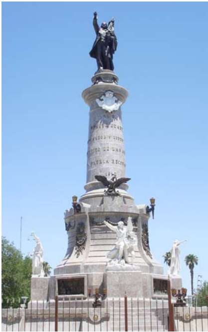
Benito Juárez monument in Ciudad Juárez.

Ciudad Juarez, just across the Rio Grande from El Paso, Texas, used to be a city of 1.4 million people. Now it is dying. During 2010, it had an estimated 3,000 murders, making it one of the most dangerous places on earth. As many as 230,000 people are thought to have fled in fear, as the Juarez and Sinaloa drug cartels battle for control of what was once a bustling border town.