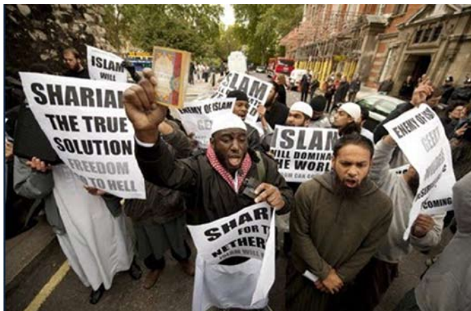
Could be anywhere in Europe but happens to be Holland.

As the native European population shrinks, there is still an enormous population growth in Third-World countries. Sixty years ago, there were three times as many Europeans as black Africans; now black Africans outnumber Europeans. By 2030, there will be almost twice as many black Africans as Europeans. At current growth rates, the population of black Africa will reach one billion by 2017 and 1.3 billion by 2030. If Europe does not stand up to the immigration invasion and enforce a strict immigration policy, its population threatens to